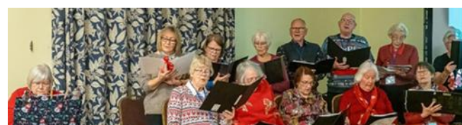
Singing for pleasure u3a Group