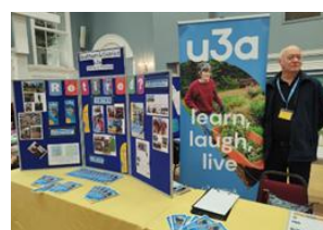
Rotary Club XmasCharity