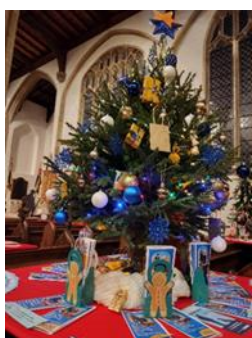
YANA u3a Xmas Tree

We are only a modestly sized u3a, but this Christmas we seem to have been everywhere! An entry for the local Church Christmas tree festival raised over £90.00 for YANA, which supports rural workers mental health and wellbeing.